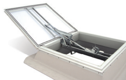
JET TOP-90 PLUS dome rooflight with 24V SHEV device, assembled on JET upstand

Note: Retrospective upgrade from JET TOP-90 to JET TOP-90 PLUS is possible.